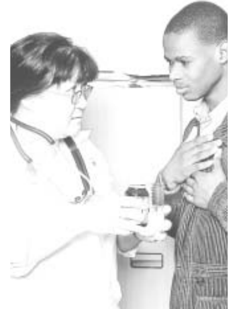
When you complete your treatment, you will be cured of TB.

To help people with TB to complete their treatment, the Department of Health encourages someone to support you throughout your treatment. This can be either a friend, relative or community member.